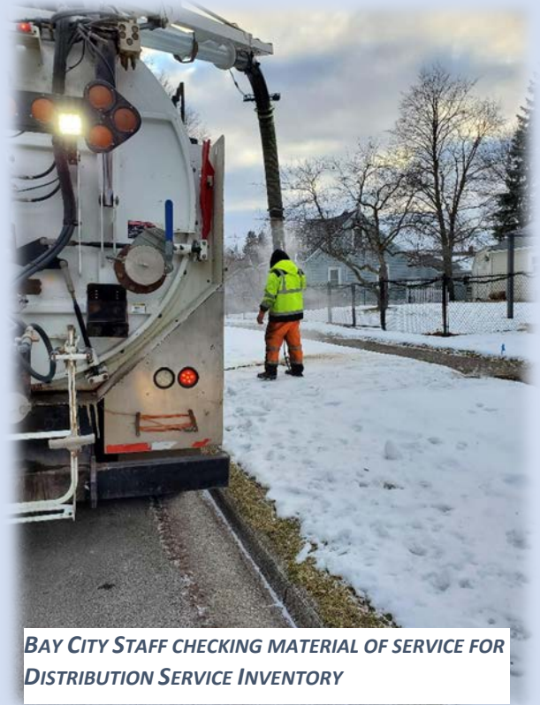
BAY CITY STAFF CHECKING MATERIAL OF SERVICE FOR DISTRIBUTION SERVICE INVENTORY